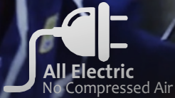
Chick Room Automation Conveyor Equipment